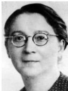
Rose Valland Born: November 1, 1898 Birthplace: Saint-Étienne-de-Saint-Geoirs, Isère, F Death: September 18, 1980, Ris-Orangis, France Skill: Art Historian, Spied on Nazis During Looting of Fr