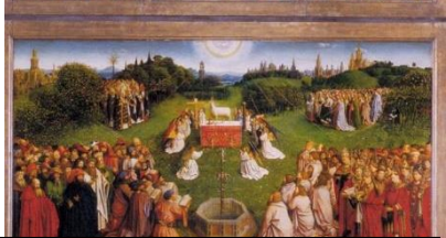
Adoración del Cordero Místico,