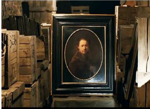
HISTORYVSHOLLYWOOD.COM - THE MO