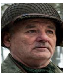
Bill Murray Born: September, 1950 Birthplace: