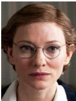
Cate Blanchett Born: May 14, 1969 Birthplace: Melbourne, Victoria, Australia