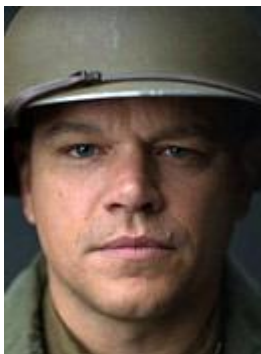
Matt Damon Born: October 8, 1970 Birthplace: Boston, Massachusetts, USA

https://www.youtube.com/watch?v=vV02JT9_qU