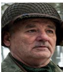
Bill Murray Born: September, 1950 Birthplace: Wilmette, Illinois, USA