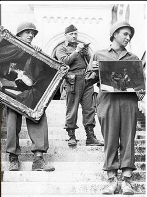
HISTORYVSHOLLYWOOD.COM - THE MONUMENTS MEN