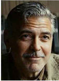
George Clooney Born: May 6, 1961 Birthplace: Lexington, Kentucky, USA