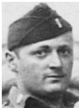
James Rorimer Born: September 7, 1905 Birthplace: Cleveland, Ohio, USA Death: May 1966, New York City, New York, USA(heart attack) Skill: Museum Curator